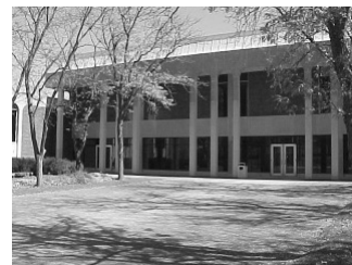
Ohio University Lancaster