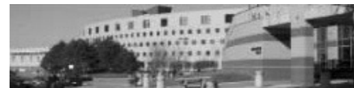
Columbus State Community College