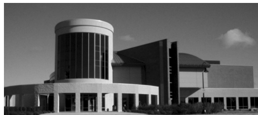
Central Ohio Technical College